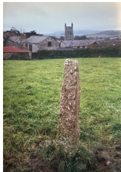
Cattle rubbing stone Bull field