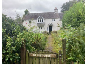
Old Post Office