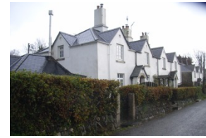
Duke of Bedford Cottages, Ottery