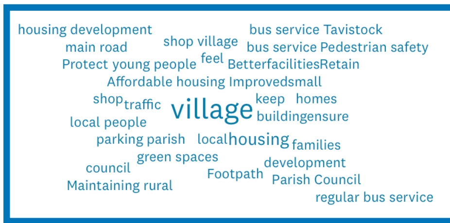
Wordcloud analysis of responses

3.6.15. Asked for their views on the main objectives of the NP, similar issues were identified, alongside protecting the environment.